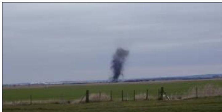
Bowers Marsh UXB being destroyed in situ