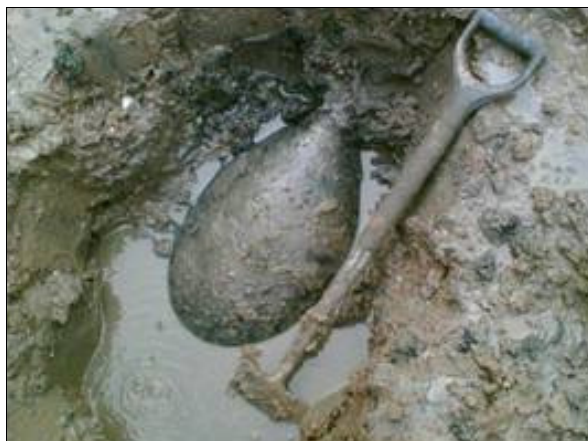
500kg WWII UXB at Bowers Marsh